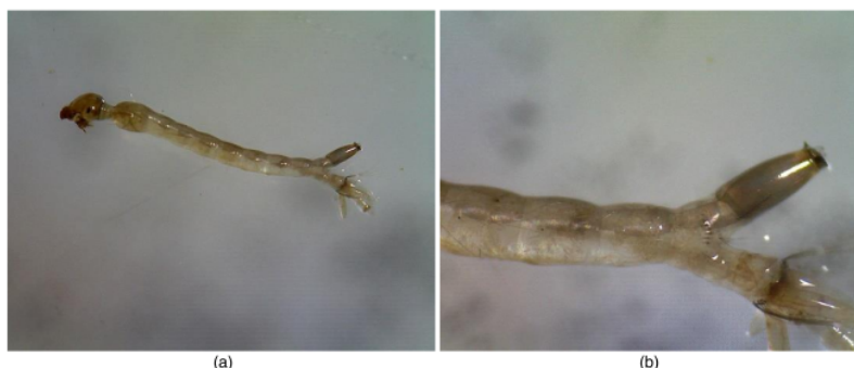
Fig. 1. The damage of the larval body parts: (a) head; (b) siphon