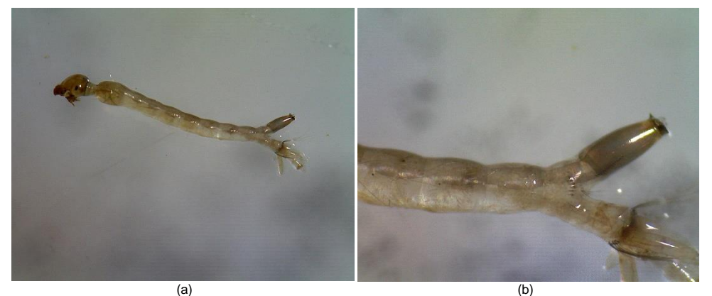
Fig. 1. The damage of the larval body parts: (a) head; (b) siphon