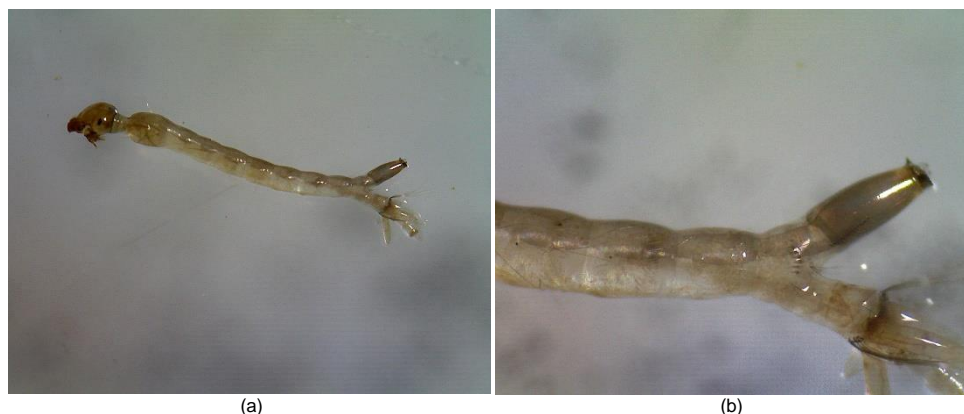
Fig. 1. The damage of the larval body parts: (a) head; (b) siphon